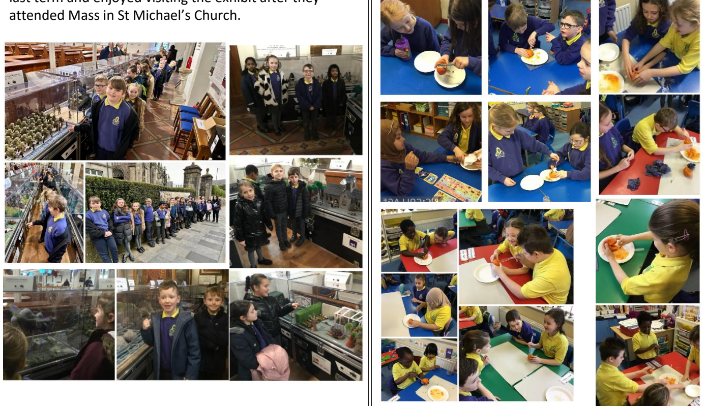
Primary 4 - Overview of planned work for February

P4 children had great fun working together to complete a STEM activity of mummifying some oranges as part of their Ancient Egyptians topic.