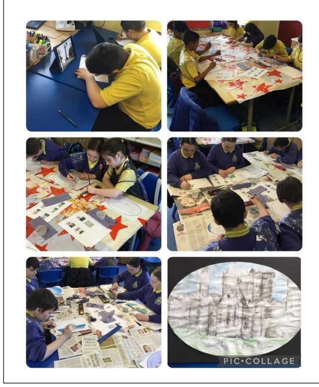
Primary 7 - Overview of planned work for February

For our Art lessons we have been creating famous Irish landmarks and landscapes. We researched the famous landmarks, created a sketch and then painted them. When completed, our landmarks will be on display in our P7 corridor and in our classrooms. We have some fantastically talented artists.