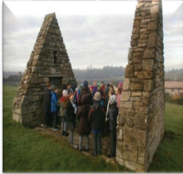
Paupers' Graveyard Memorial.

We went to the new museum and saw leather, wrecked shoes belonging to victims of the workhouse. There was even a baby size, I felt really sorry for everyone during the Famine.