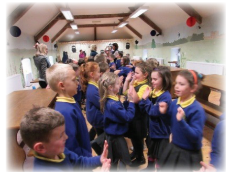
We went on an autumn trail and joined in the Halloween ball.