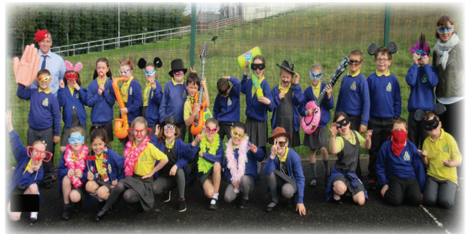
KS2 Best Attenders