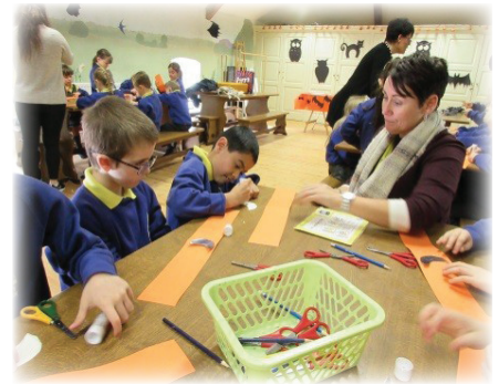
P3 classes visited Florencecourt for a Halloween Ball.