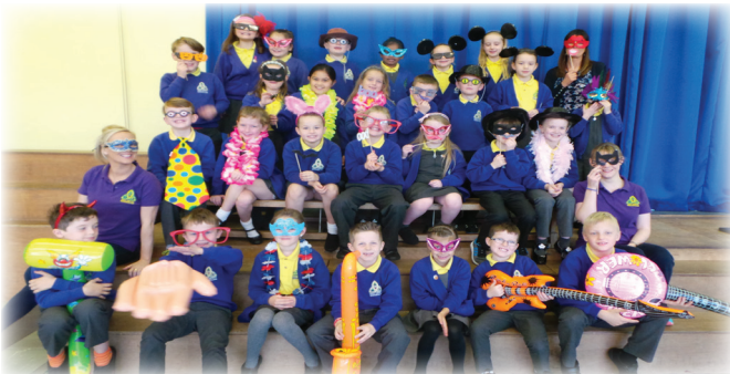
KS1 Best Attenders